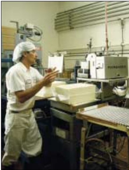
High volume processing or manufacturing applications requiring a bar code label on a box or pallet are perfect for the Fairbanks Bar Code Labeling System.