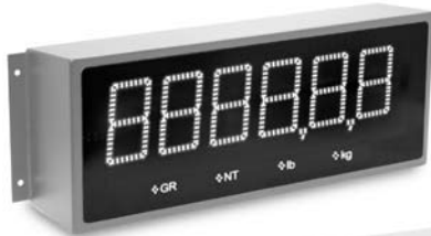
LaserLight 4" digit