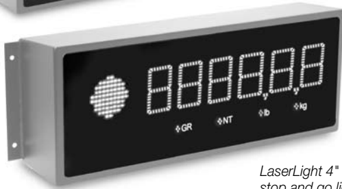
LaserLight 4" digit with stop and go lights